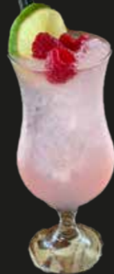
RASPBERRY GIN FIZZ